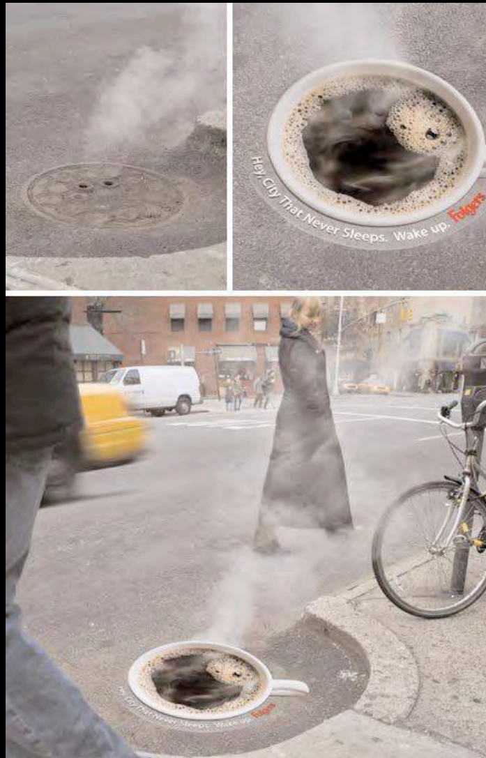
Best "Coffee ad"