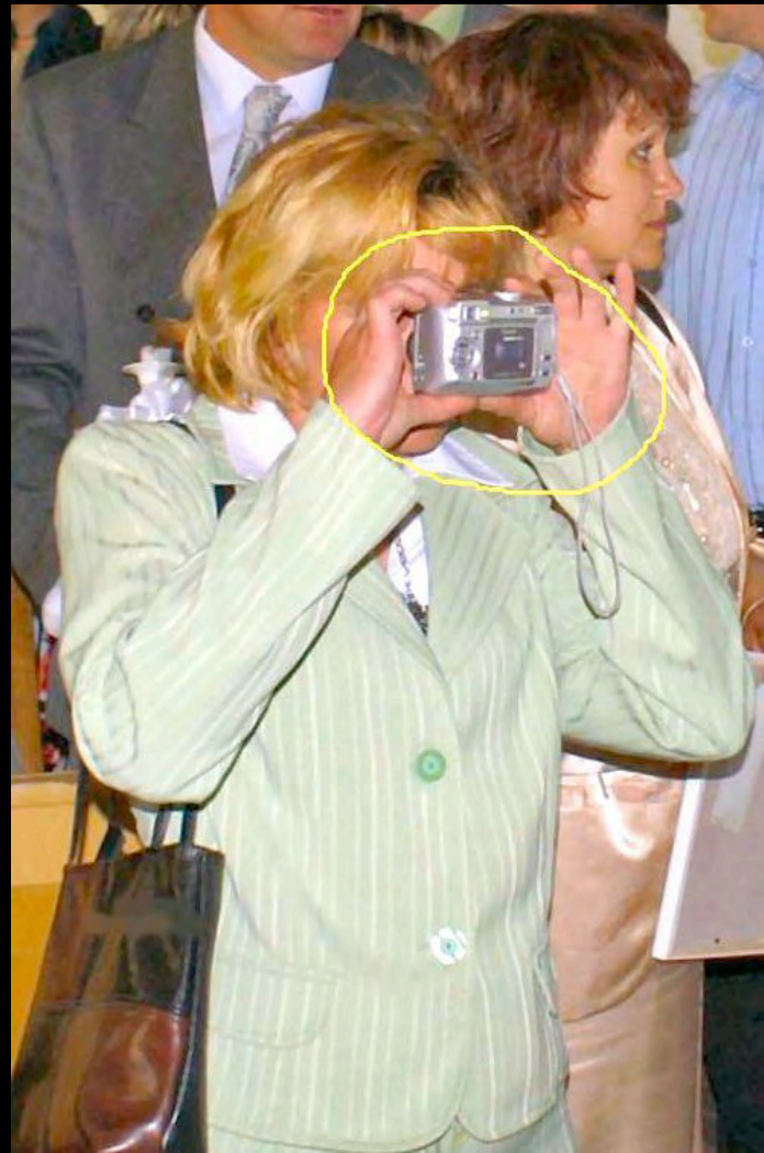
Best “Queen of the Blondes”